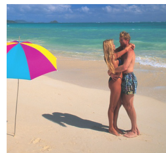
All prize levels for two persons.

For more information call North Coast Life 1-800-541-5858 Ext. 215